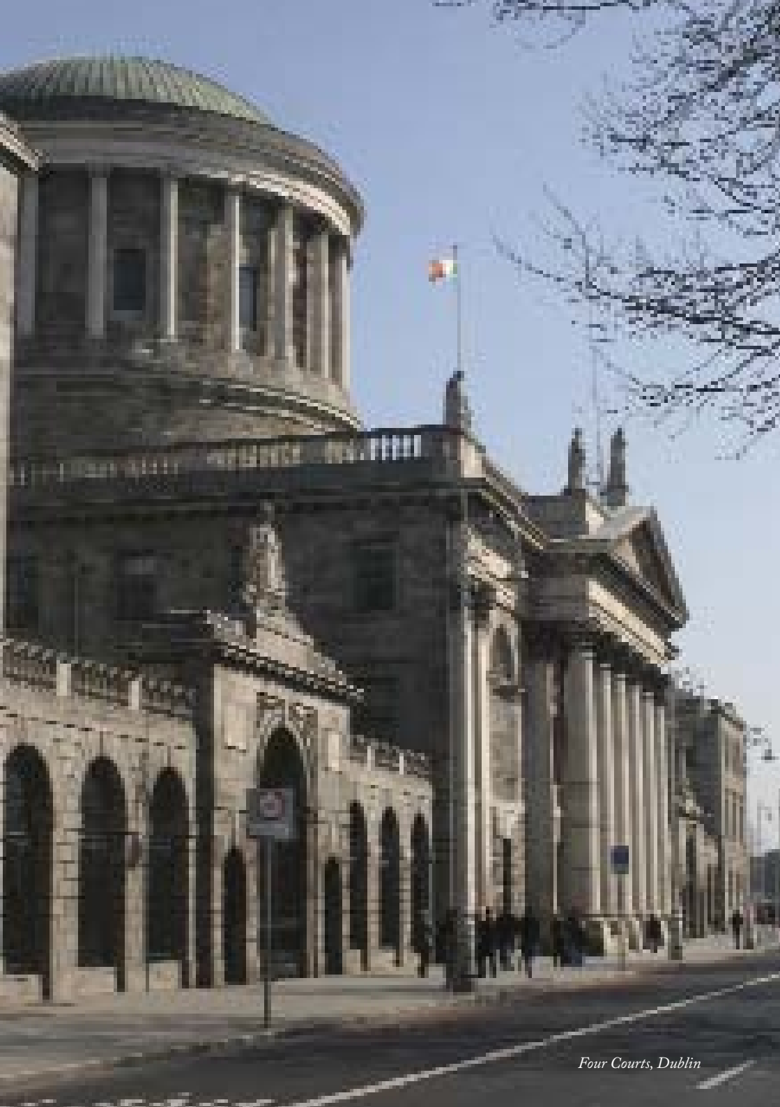
Four Courts, Dublin