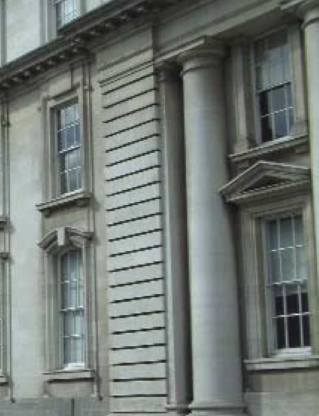
Department of Finance, Dublin 2