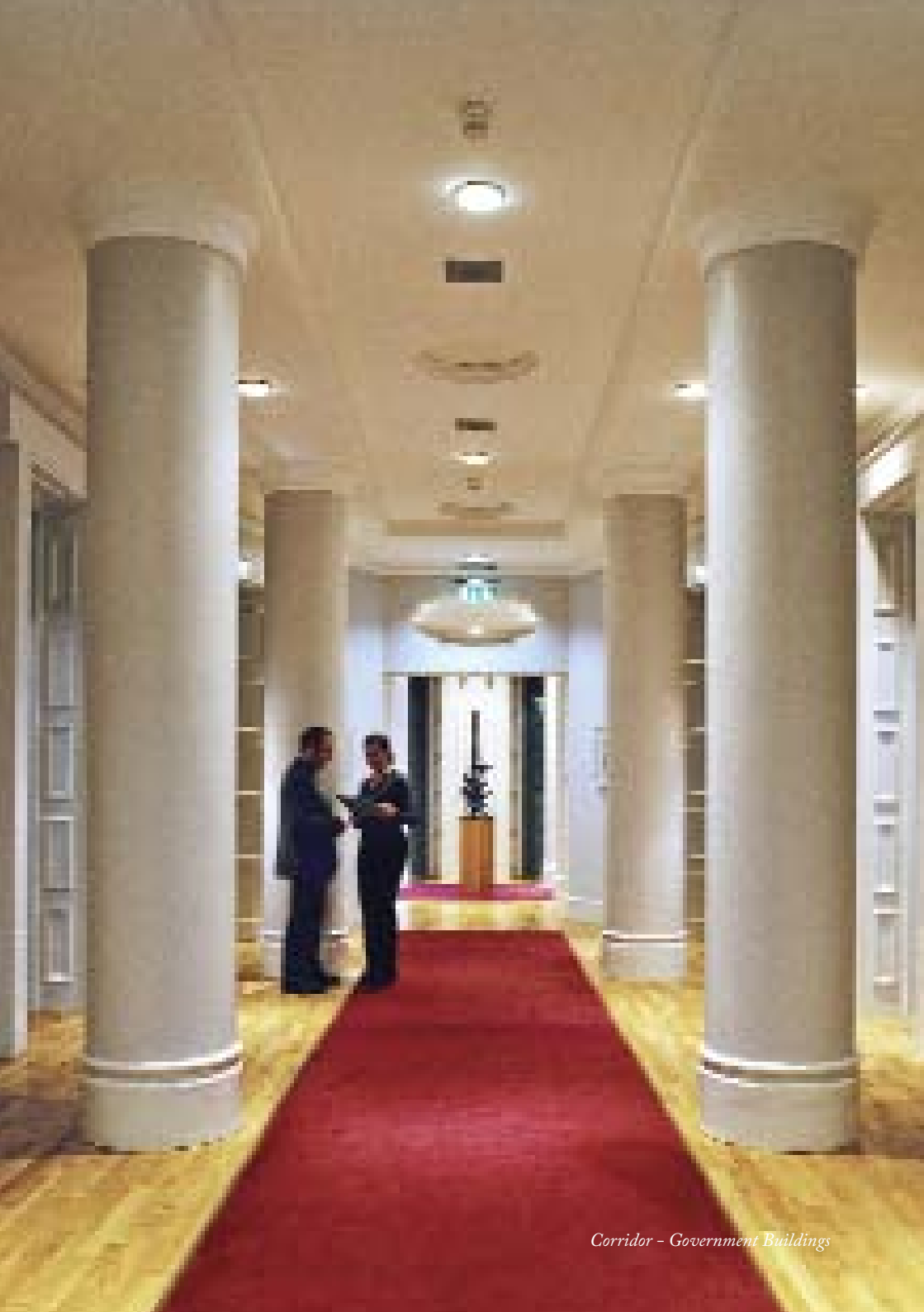
Corridor - Government Buildings