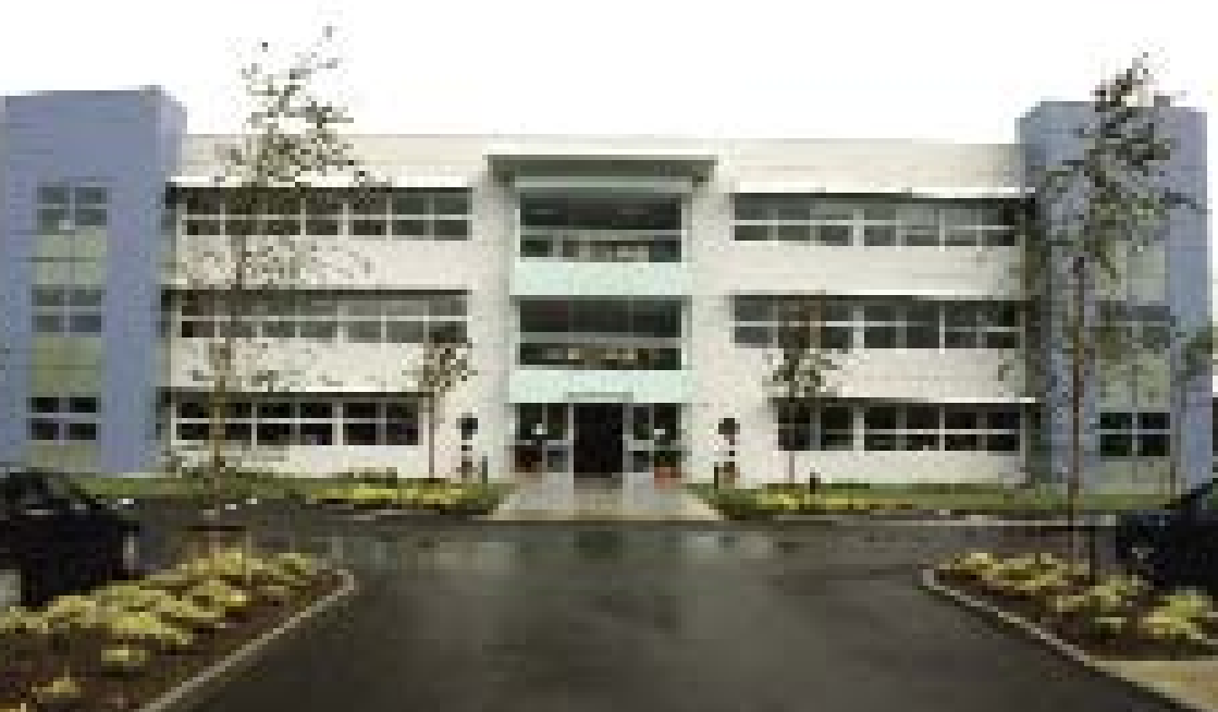
Department of Finance, Tullamore, Co. Offaly