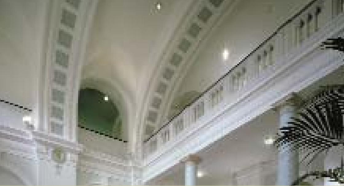
Entrance Hall - Government Buildings