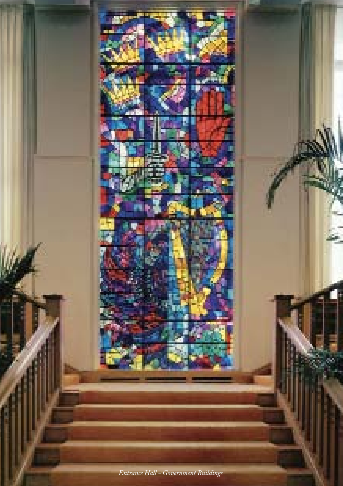
Entrance Hall - Government Buildings