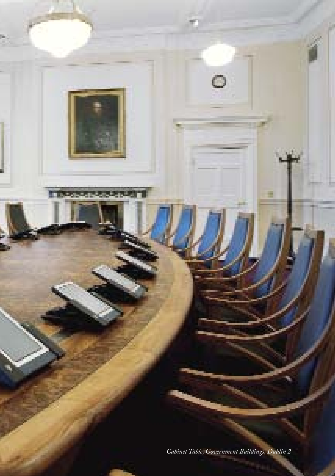
Cabinet Table, Government Buildings, Dublin 2