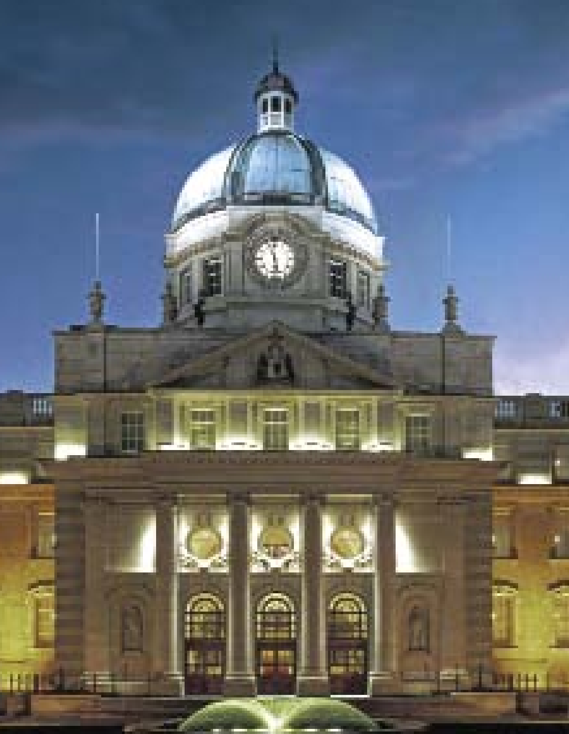
Government Buildings, Dublin 2