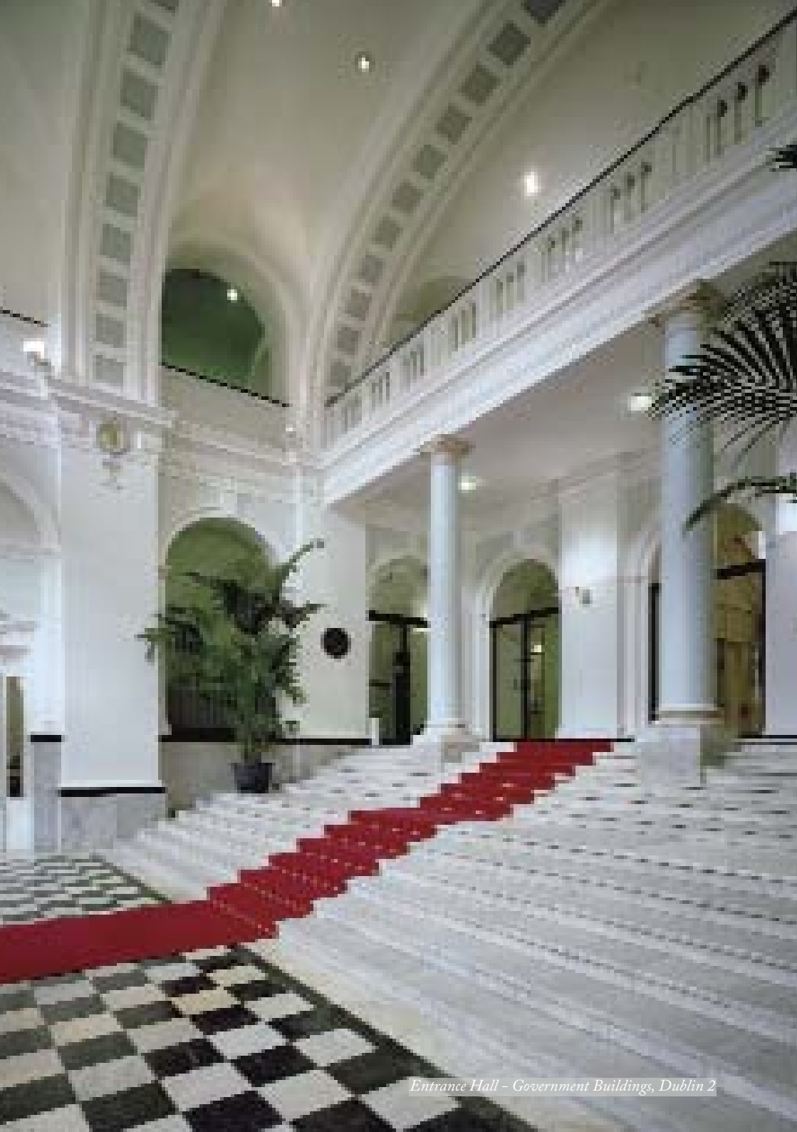
Entrance Hall - Government Buildings, Dublin 2